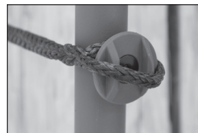
FIGURE 2B Loop partially around strap/rope mount