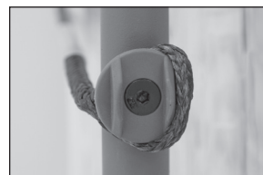
FIGURE 2C Loop around edge of strap/rope mount